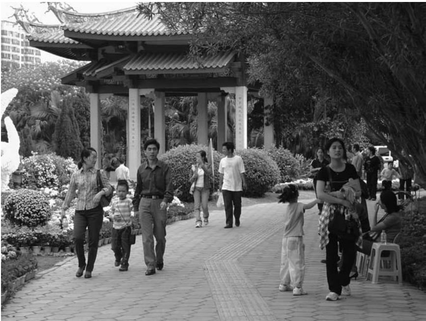
Figure 1.1 Saturday in Quanzhou's East Lake Park.

On the face of it, the title Leisure and Power in Urban China contains a curious pairing of concepts. If leisure is the kinds of fun we have after work, in the comfort of our own homes or the lively surroundings of a café or local sports grounds, what has power got to do with it? One answer can be found if we look at leisure from a historical perspective. The question of when and how the ordinary working people should recreate has been a topic for discussion among religious authorities, industrialists and political commentators alike (see Thompson 1967: 86; Roberts 1999: 27; Bauman 1998: 9–10; Bayat 2007). In some respects, contemporary discussions about the dangers of web surfing and the amount of