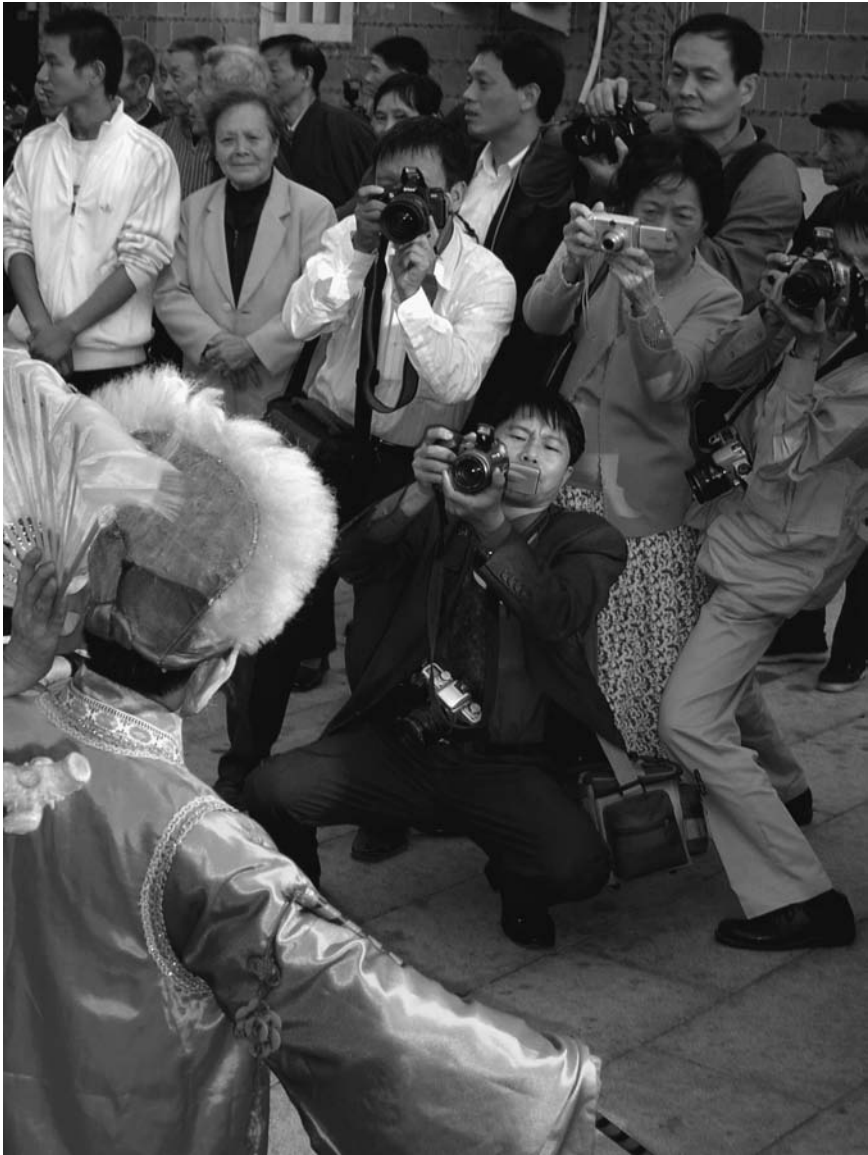
Figure 5.2 Members of the Photographers' Association in action.

photographers. Its many activities notwithstanding, the Photographers' Association had never received funding from the local government prior to 2007.