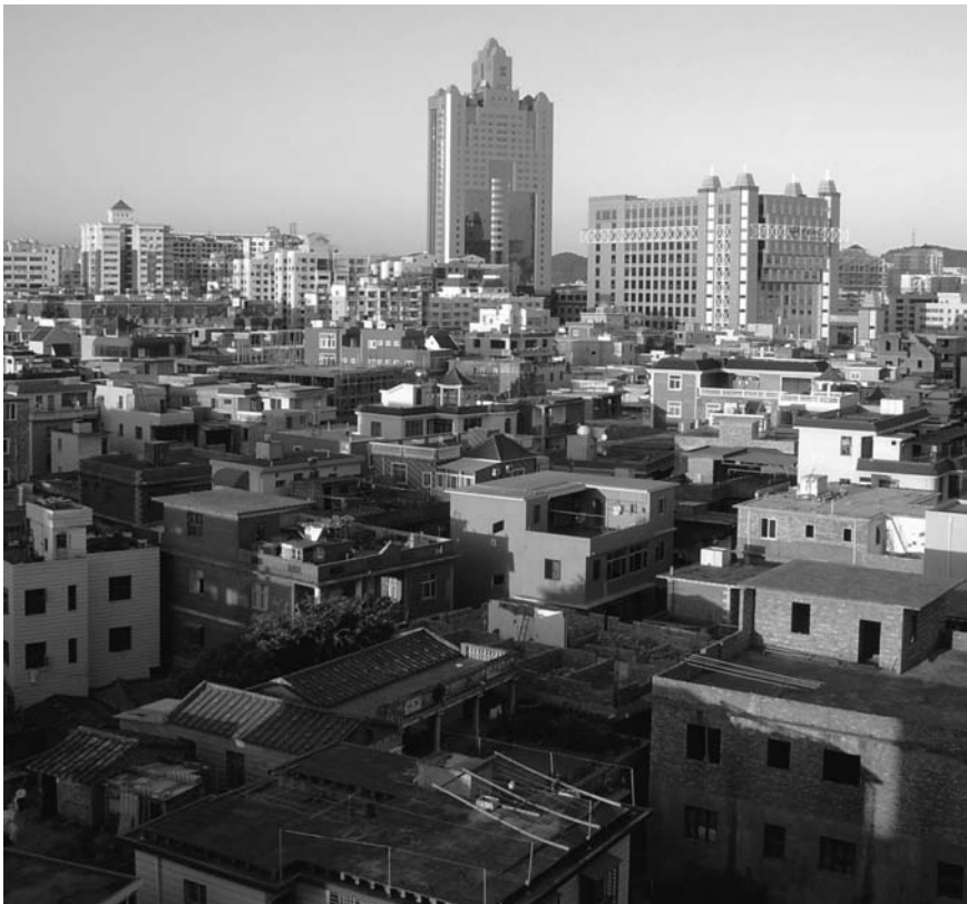
Figure 1.1 The skyline of contemporary Quanzhou.

If you were to visit Quanzhou, and if you were so lucky as to be accompanied by a local friend or business partner, you would inevitably be introduced to two of the most common forms of local leisure, namely a trip to the scenic Qingyuan Mountain and a relaxing break in a tea house. Your mountain excursion would most likely be taken by car, and on your way down from the peak you would