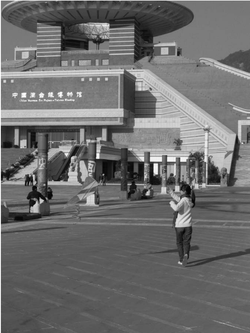
Figure 4.3 Kite-flying on a Sunday afternoon at Mintaiyuan Museum Square.

lid over the city sewers, and because of the considerable weight of stone statues (Chen Xiangmu 2006), the material chosen for these sculptures is concrete covered in gilded paint. Several people expressed their disappointment at how cheap the statues look. Some also hinted that the square was a project initiated by one of the vice mayors with the sole purpose of promoting Quanzhou's brand