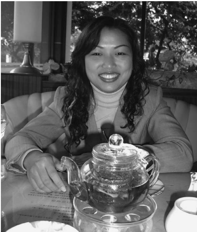
Figure 7.1 Migrant worker with a taste for middle class-style consumption.