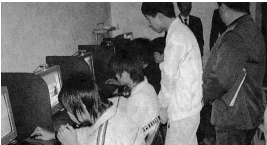
Figure 6.2 Youth in one of Quanzhou's 'black' Internet cafés.

of two black Internet cafés on the outskirts of Quanzhou, taken from a newspaper article entitled 'On the Spot: Internet Cafés Crowded with Children':