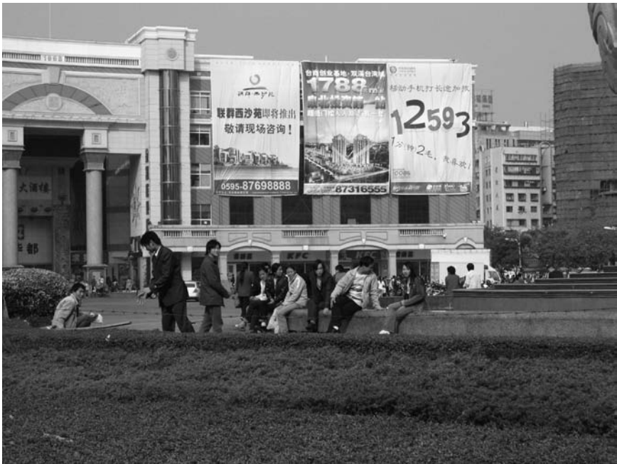
Figure 4.4 Young workers watching the renao at Fengze Square.

Leisure can be practiced in the most unlikely places. Every morning around nine o’clock, a group of middle-aged men gather to play cards on the steps of a local branch of the China Construction Bank. These men are day labourers and motorbike taxi drivers. At nine, the rush hour is over and business is slowing