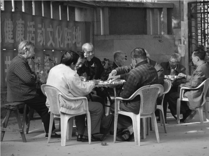
Figure 4.1 Elderly people enjoying a game of majiang at Tongfo si .

In Quanzhou, the local city administration provides physical places designated for leisure activities, such as museums, parks and public squares. But the leisure space envisioned by local administrators does not necessarily correspond to the map of leisure places that the city population live by. Lefebvre describes this phenomenon as a discrepancy between the ‘conceptualized’ space ‘produced’ by authorities and space as it is ‘lived’ by inhabitants (Lefebvre 1991: 38–9). Inspired by Lefebvre’s theories of the social production of space, this chapter discusses how designated places for leisure are produced, and how and why some attempts at creating places for leisure fail to generate activity and attract people.