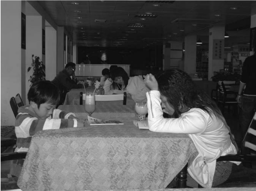
Figure 5.1 Young and old reading and relaxing in one of Quanzhou’s book cafés.

In January 2007, Quanzhou’s Bureau of Education, in cooperation with one of the local newspapers, suggested the following leisure activities to ensure a ‘healthy, safe, and happy’ ( jiankang, anquan, you yiyi ) New Year holiday for middle school students: reading novels; and writing essays about one’s education plans or the ongoing construction of a Harmonious Quanzhou (‘Hanjia...’ HXDSB , 31 January 2007, B3). In the spring of the same year, a row of colourful posters outside the Quanzhou Library encouraged passers-by to ‘Surf the Internet in a healthy manner and keep net addiction at a distance’ ( jiankang shangwang yuanli wangyin ). These are examples of how local state-run institutions communicate the logics of the leisure ethic to the Quanzhou public. Both texts