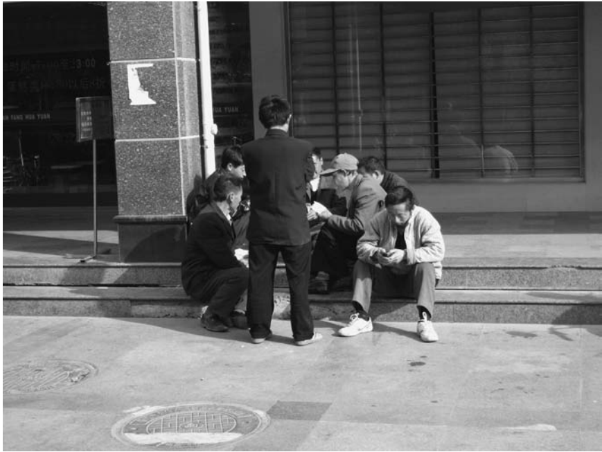
Figure 4.5 Playing cards on the steps outside China Construction Bank.

down. This gives these men a chance to snatch a moment of leisure while waiting for customers and prospective employers to approach them. The reason the men gather in this particular spot is that the number of residents and businesses in the area increases the likelihood of getting a job offer. At the same time, they obviously prefer spending their time in the company of peers, playing cards and chatting, rather than sitting on their bikes waiting to be approached. Whether or not this practice is best described as leisure depends on how we define work and leisure. I argue that although these drivers are compelled to wait at the crossroads, their card-playing is to a certain extent comparable to the practices of office clerks who drink tea with friends, read novels or play computer games in the workplace, as discussed in Chapter 2. The steps in front of the bank prove to be a convenient leisure place for these men, as it is close to job opportunities and provides relaxation and the opportunity to socialize – and in addition, the chance to win a few yuan in the game.