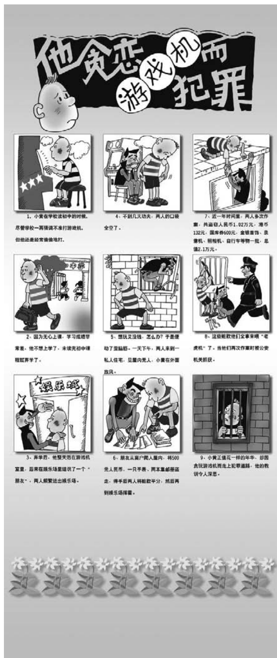
Figure 6.1 ‘Clinging to video games made him a criminal’