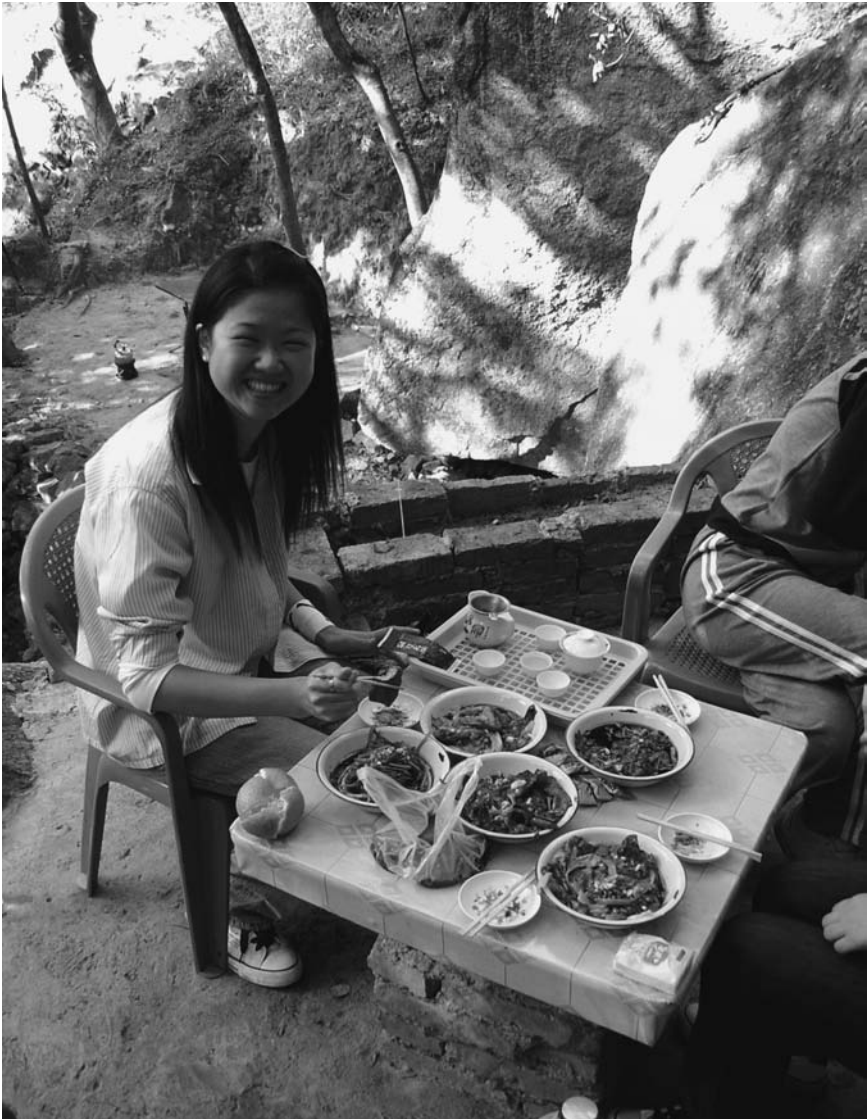
Figure 8.2 A lunch of tea and vegetables at Qingyuan Mountain.