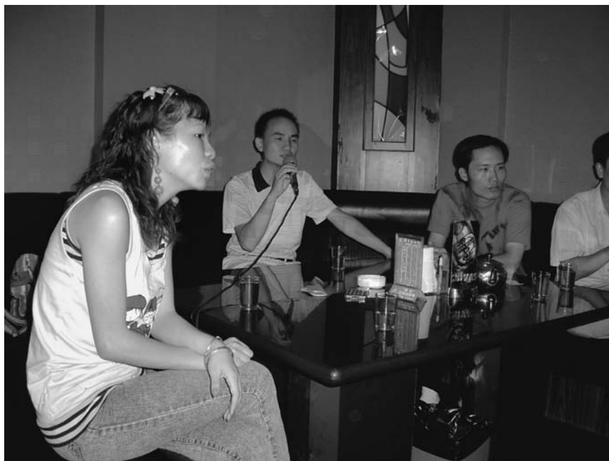
Figure 6.4 Singing – or at least mouthing the words – together at the karaoke parlour.

Quanzhou has a choice of karaoke parlours that cater to the various customer segments, ranging from the extravagant services of the Quanzhou hotel, where