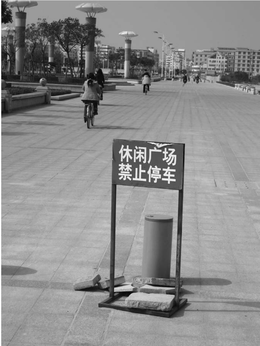
Figure 4.2 ‘Leisure square. No parking!’

areas take young children there to play, and on Sundays and public holidays the square swarms with people flying kites, enjoying the musical fountains, and purchasing snacks from the many vendors whose carts line the periphery of the square. The neighbouring Quanzhou Museum faces its own public square, which stretches all the way to the northern entrance of West Lake Park. This ground is paved with local stone and adorned with stone carvings and flower displays, as