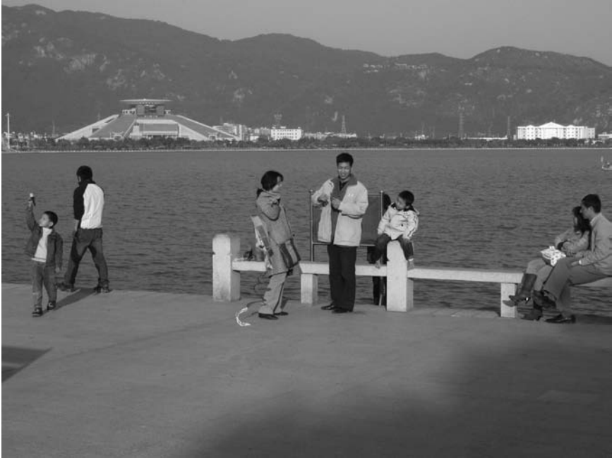
Figure 2.1 Sunday leisure in West Lake Park.

In Chinese written sources the terms ‘ xiuxian ’ and ‘ xianxia ’ (leisure), and the more vernacular ‘ ziyou shijian ’ (free time) are used interchangeably. In the case