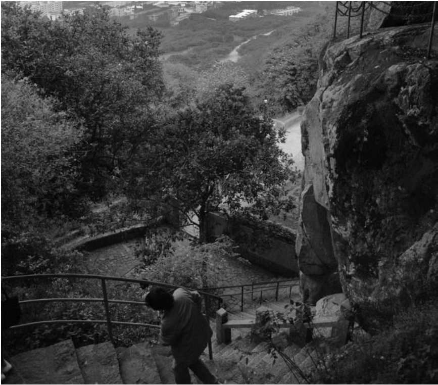
Figure 8.1 A woman making her way up the stone path at Qingyuan Mountain.

In the previous chapters I have demonstrated the limited influence the government's idealized visions of leisure space have on people's actual leisure practices. The cases from Quanzhou tell us that ordinary people find ways to practice – and even organize – a variety of leisure activities without being in direct opposition to official policies and regulations. In this chapter, however, I will focus on one particular leisure place, Qingyuan Mountain, which became a stage